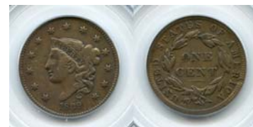
1839/6 1C PCGS VF30 CAC

From time to time, we are going to be highlighting some special group offerings in these newsletters and the one we have this week is very interesting. These group offerings will likely be one of a kind as well, so if it piques your interest call right away.