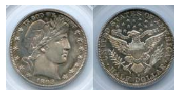
1892-O 50C MICRO O PCGS AU58 Secure