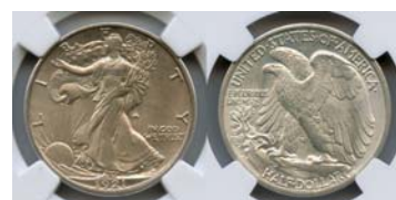
1921-S 50C NGC MS63 CAC