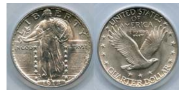
1918/7-S 25C FS-101 PCGS MS64 CAC Secure