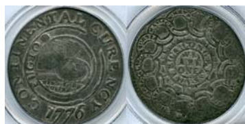
1776 $1 Currency, Pewter PCGS VF25 CAC