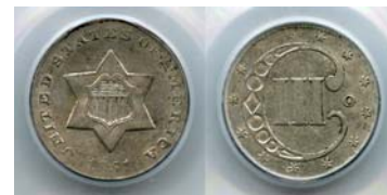
1851-O 3C PCGS AU55 CAC