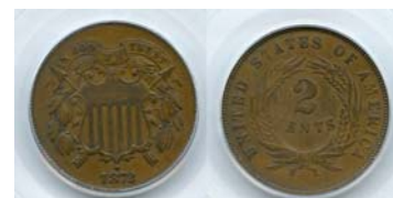
1872 2C PCGS AU55 CAC