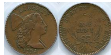
1794 1C S-30, R-1 PCGS XF45 CAC