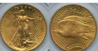
1924 $20 PCGS MS65+ Secure with Plus