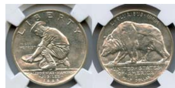
1925-S 50C California NGC MS66