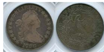
1796 50C 16 Stars PCGS F15