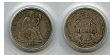
1867-S 10C PCGS XF40