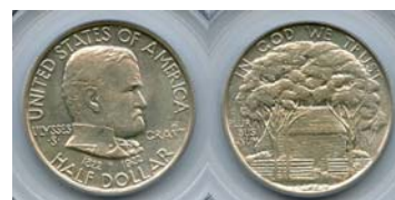
1922 50C Grant STAR PCGS MS63