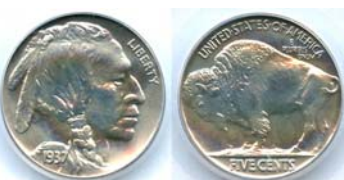
1937 5C PCGS PR67+ Secure with Plus