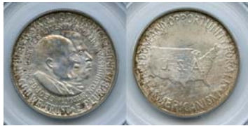
1951-D 50C WASH-CARV PCGS MS66 CAC