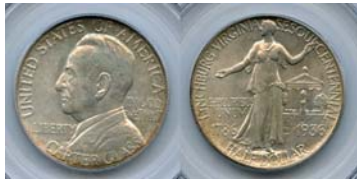
1936 50C LYNCHBURG PCGS MS66+ Secure with Plus