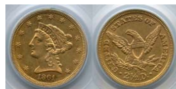
1861-S $2.50 PCGS AU53