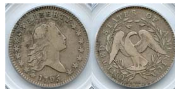
1795 50C O-104, R-4 PCGS VF25 CAC

August 11-15 World's Fair of Money ANA, Boston MA Tables 819 & 821