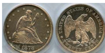
1878 20C PCGS PR63