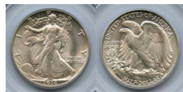
1916-S 50C PCGS MS64 CAC