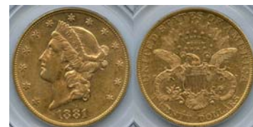
1881 $20 PCGS AU53 Secure