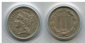
1883 3CN PCGS AU50 CAC