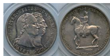
1900 $1 Lafayette PCGS MS62 Secure