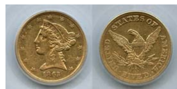
1863-S $5 PCGS XF40