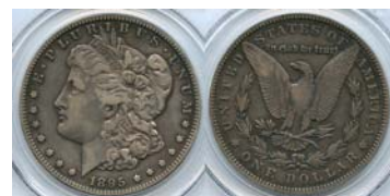
1895-S $1 PCGS VF30