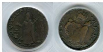
St Patrick Farth New Jersey PCGS VF30 CAC