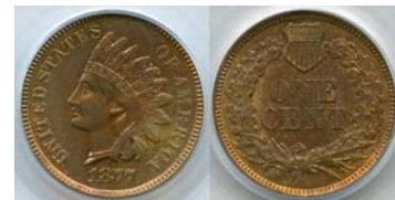
1877 1C PCGS MS63RB